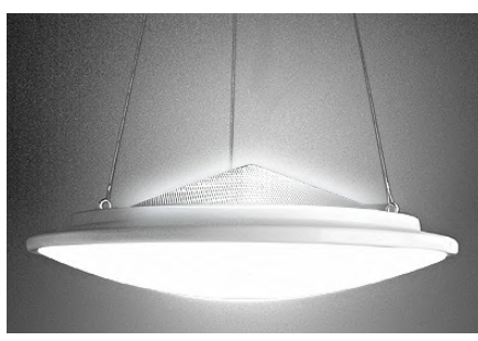
10' Aircraft Cable Suspension (AC10) Shown with Uplight (UPL) Option