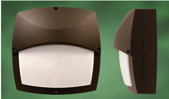
Linz STYLE A: Eyelid Wall Mount