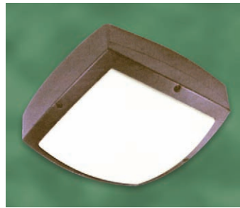
Linz STYLE C: Open (NO Eyelid) Ceiling Mount