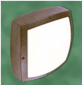
Linz STYLE B: Open (NO Eyelid) Wall Mount