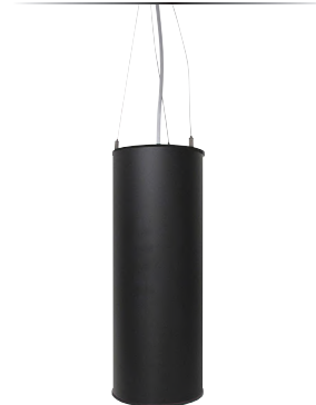
Pendant Aircraft Cable (PEND-ACR)