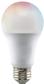
A19 Smart Bulb