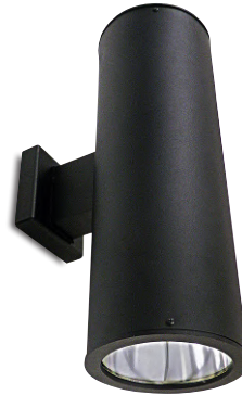
Wall Mount (WM)