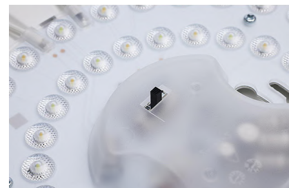
Selectable CCT Switch Located on LED Board Module