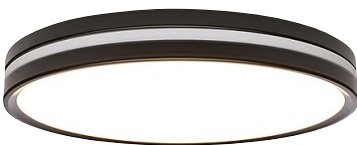
Down Light Mode