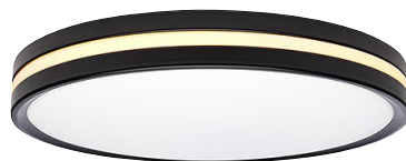
Night Light Mode