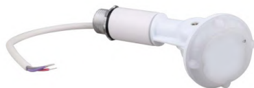
Bi-Level Dimming/Ambient Sensing Occupancy Sensor - External (BLDA-E)